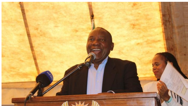
Deputy President, Cyril Ramaphosa giving the keynote address.

He added that the R6 million Centre is a much appreciated initiative which goes in line with government's efforts to address challenges facing Early Childhood Development Centres.