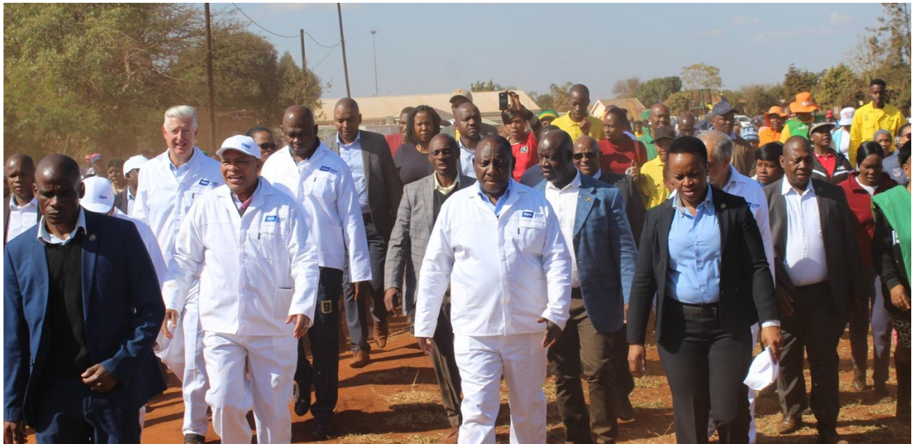
Minister of Health, Dr Aaron Motsoaledi, Premier of Limpopo, Stan Mathabatha and Deputy President, Cyril Ramaphosa going to address the masses in Mookgopong