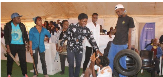
Local group Fedilicious Entertainment group, performing for the crowd