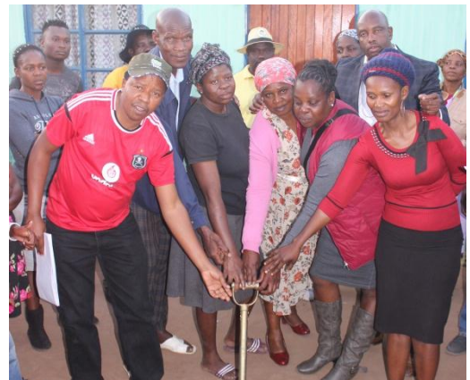
LLM councillors and Mayor sod turning in Leseding