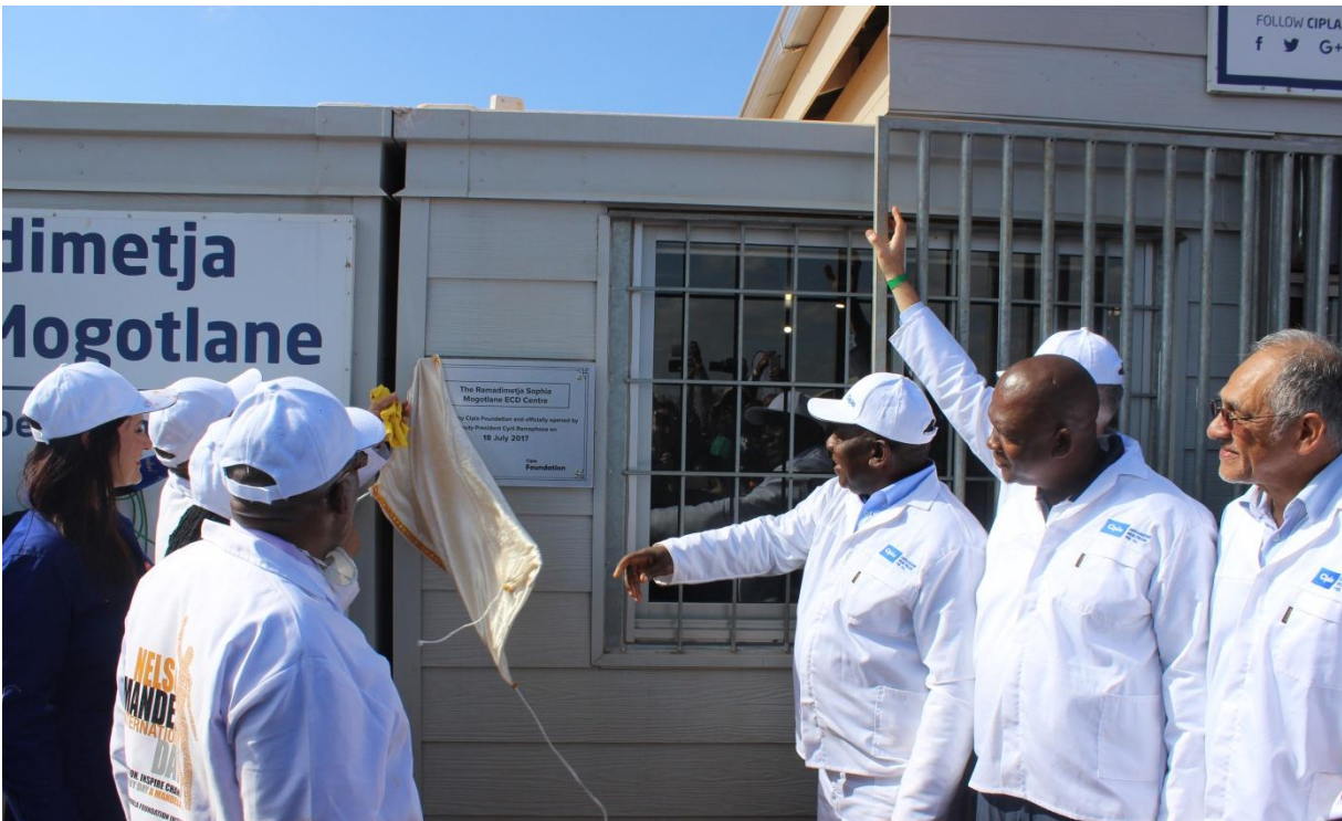
Minister of Health, Dr Aaron Motsoaledi, Premier of Limpopo, Stan Mathabatha and Deputy President, Cyril Ramaphosa officially opening the Ramadimetja Sophia Mogotlane ECDC