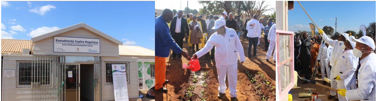
Minister of Health, Dr Aaron Motswaledi, Premier of Limpopo, Stan Mathabatha and Deputy President, Cyril Ramaphosa planting and painting at Ramadimetja Sophia Mogotlane ECDC

Ramadimetja Mogotlane Early Childhood Development Centre. The Centre was donated by CIPLA Pharmaceutical Company to the community of Mookgopong following a request by the Deputy President